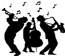
Anderson High School Jazz Band