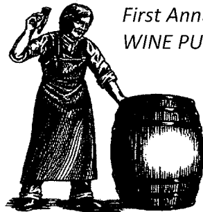
First Annual WINE PULL!